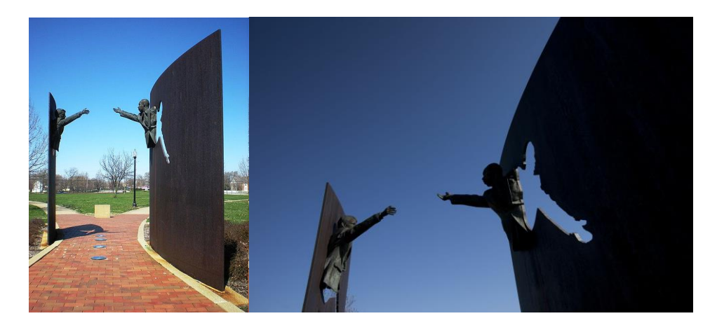
Images 1 and 2. Landmark for Peace Memorial, bronze and Cor-Ten steel. Kennedy-King Park, Indianapolis, IN.